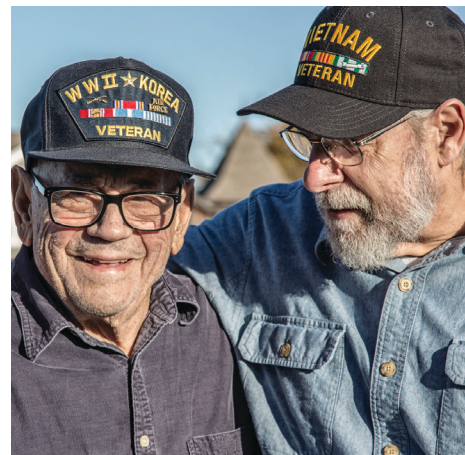
Veterans: Please contact your dentist to set up an appointment for your FREE implants.

Reflect Implant Systems offer surgical and prosthetic compatibility with "BIG" brands but does so for much less—while at the same time, offering uncompromised quality and performance so vital to your patients.